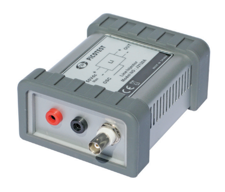
Picotest J2120A Line Injector