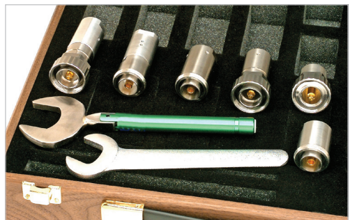
Mechanical calibration kits