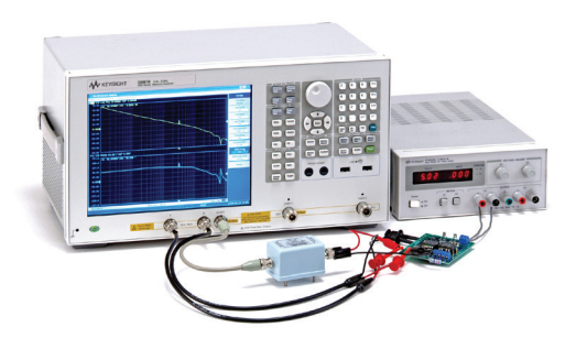
Pomona 3787-C-18 test lead (connected to gain-phase receiver ports) Pomona 2886 BNC breakout (connected to 0017CC)

Picotest web page: http://www.picotest.com