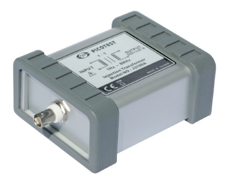
Picotest J2100A Injection Transformer