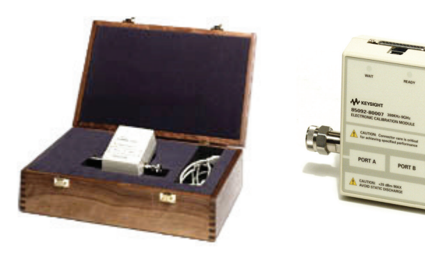
Electronic calibration (ECal) modules