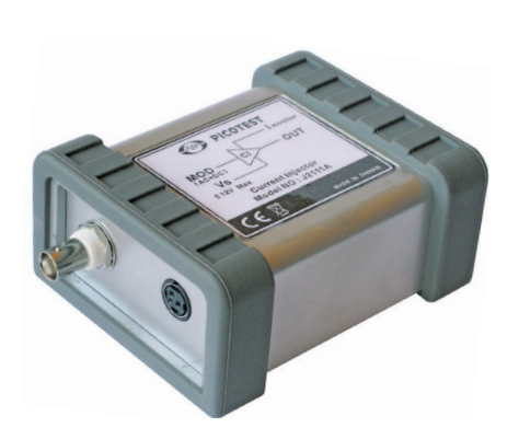
Picotest J2111A Current Injector