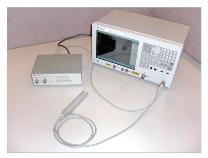
1141A, 1142A, and E5061B